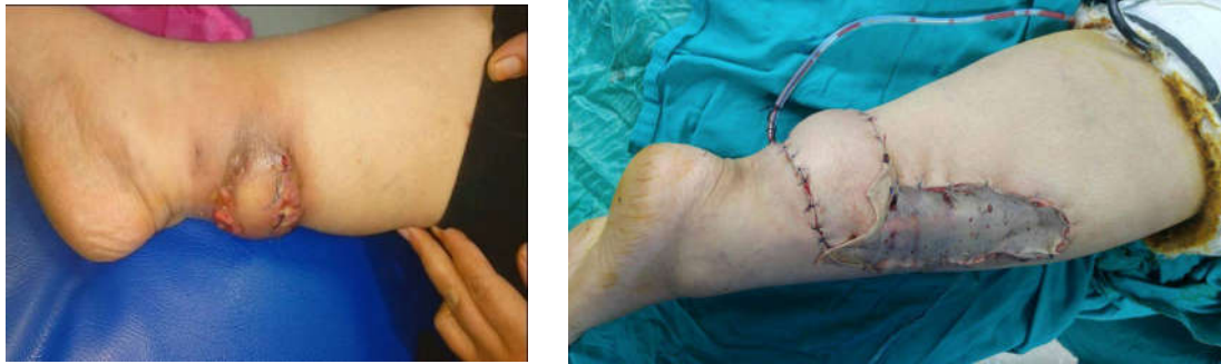
Figure 4: Posterior tibial artery perforator flap for covering a heel defect.