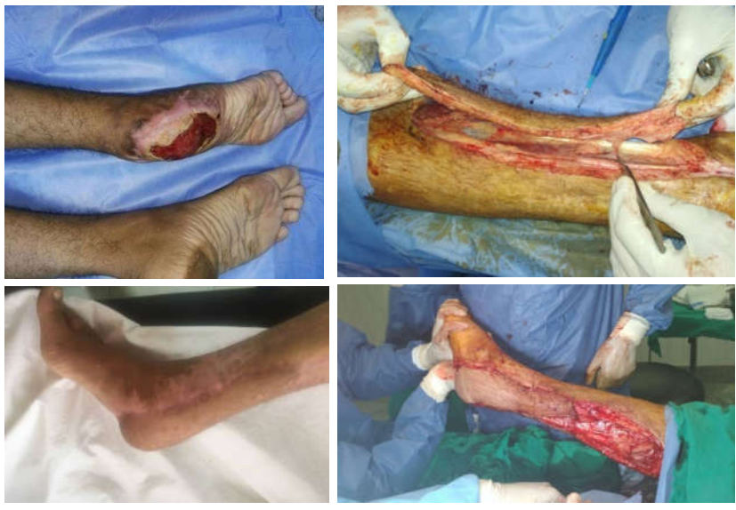
Figure 5: Traumatic raw area on outer aspect of left foot and exposed lateral malleolus reconstructed by a peroneal artery perforator propeller flap for the malleolus and a split thickness skin graft for the foot. Ischemia and debridment of the distal part.