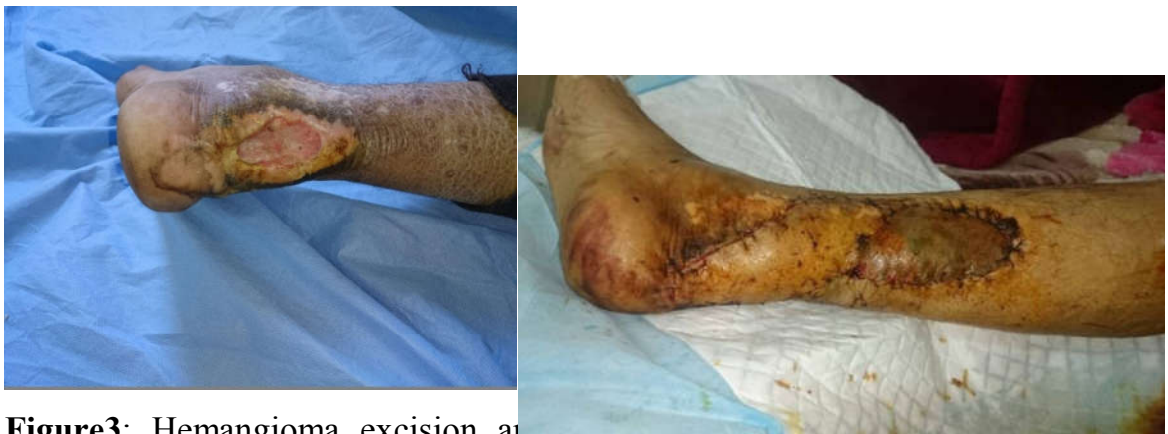
Figure3: Hemangioma excision and reconstruction by peroneal artery perforator flap