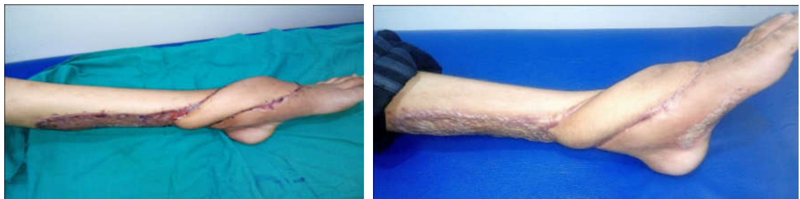
Figure2: posterior tibial artery perforator flap for covering exposed Tendo- Achilles