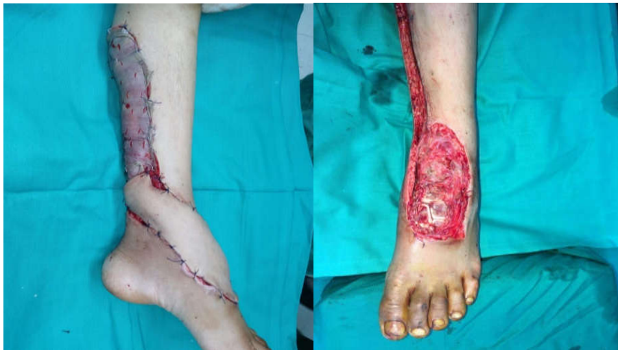
Figure 1: posterior tibial artery perforator propeller flap for covering a defect on dorsum of left foot.